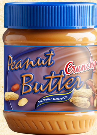
Creamy Peanut Butter 350g