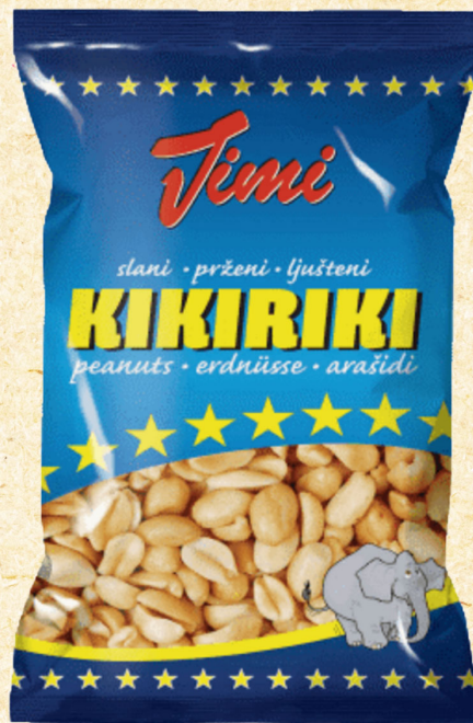
Timi Peanuts vacuum pack 400g