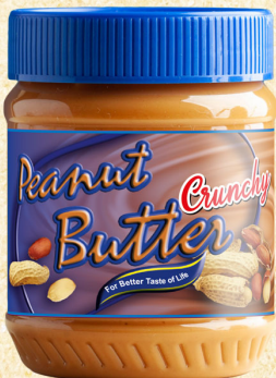
Creamy Peanut Butter 227g