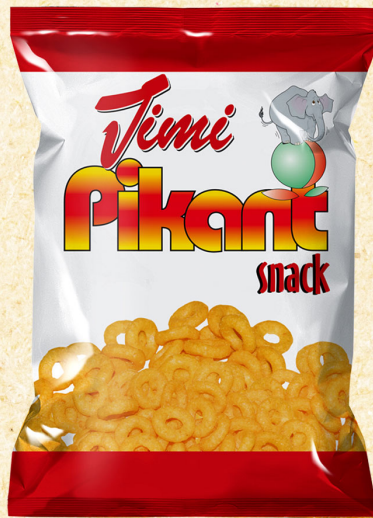
Timi Flips Piquant 30g