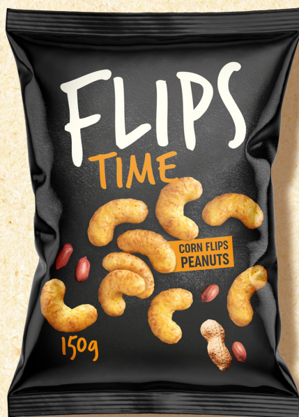
Flips Time Peanuts 150g