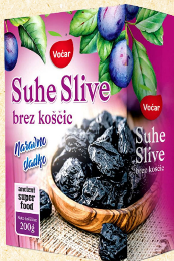
Prunes pitted 200 g