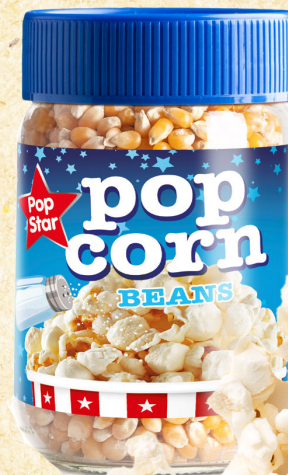
Pop Star Pop corn beans 350g