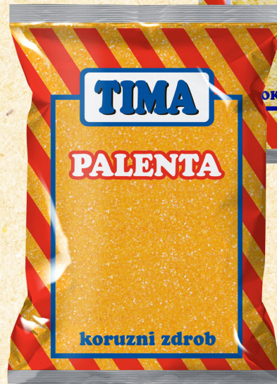
Polenta 800g / 1000g