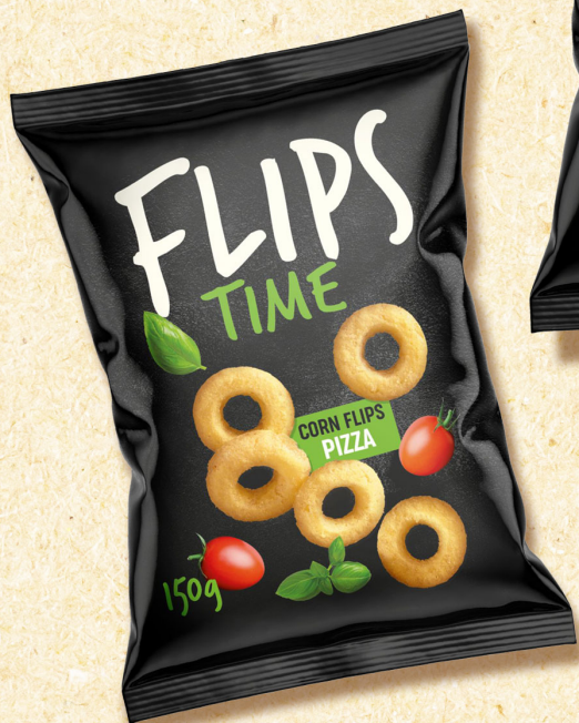
Flips Time Pizza 150g