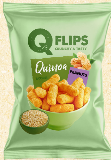
Q Flips Peanuts 80g