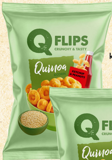
Q Flips ketchup & peanuts 80g