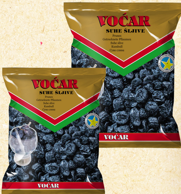
Prunes 250g, 500g