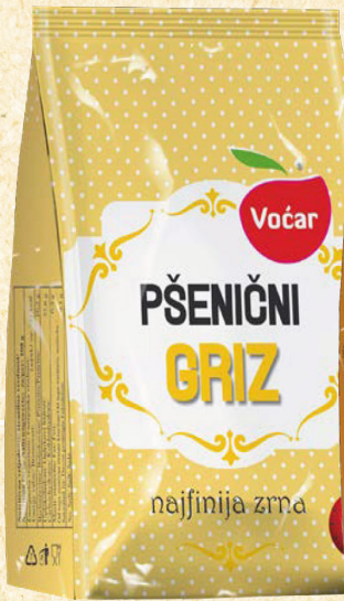
Wheat Grits 200g