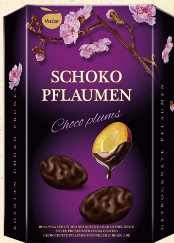
Choco Prunes pitted 200 g