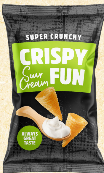
Crispy Fun Sour Cream 50g, 100g