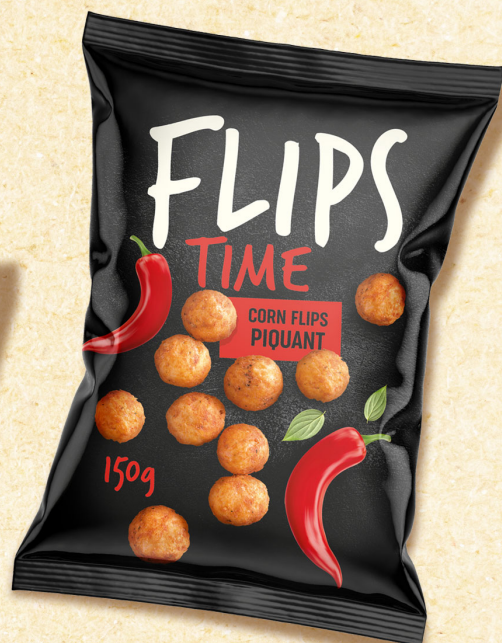
Flips Time Piquant 150g