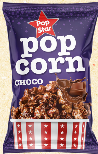
Pop Star Pop corn Choco 100g