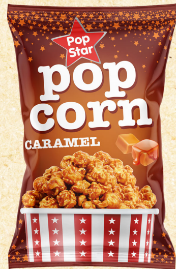
Pop Star Pop corn Caramel 100g