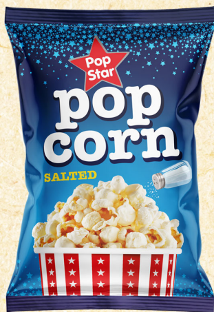
Pop Star Pop corn Salted 40g