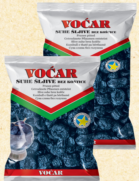
Prunes pitted 200g, 400g