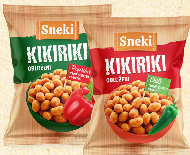
Coated peanuts paprika, chili