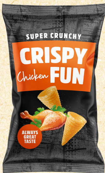
Crispy Fun Chicken 50g, 100g