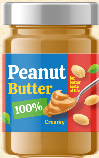
Peanut Butter Creamy 100 % 350 g