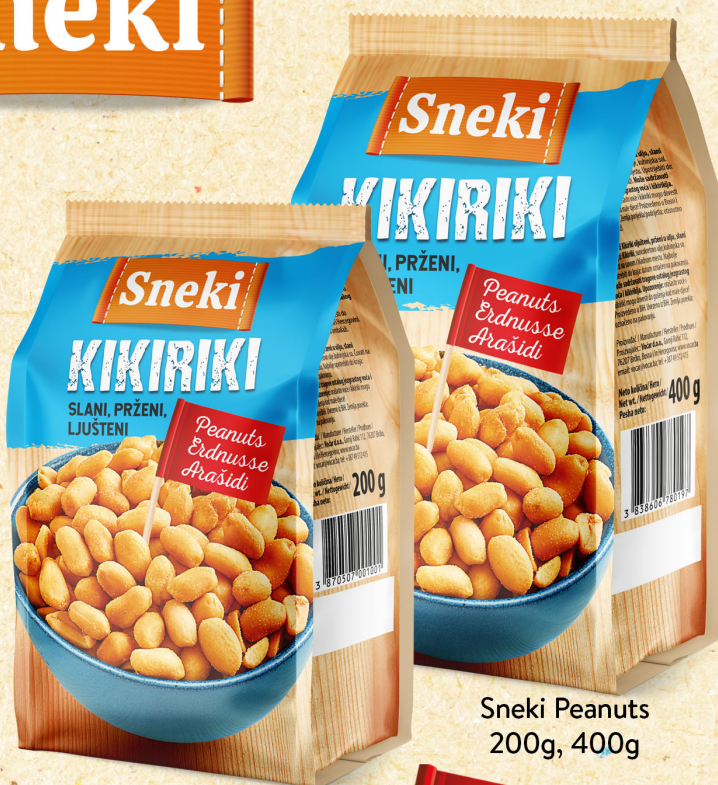
Sneki Peanuts 200g, 400g