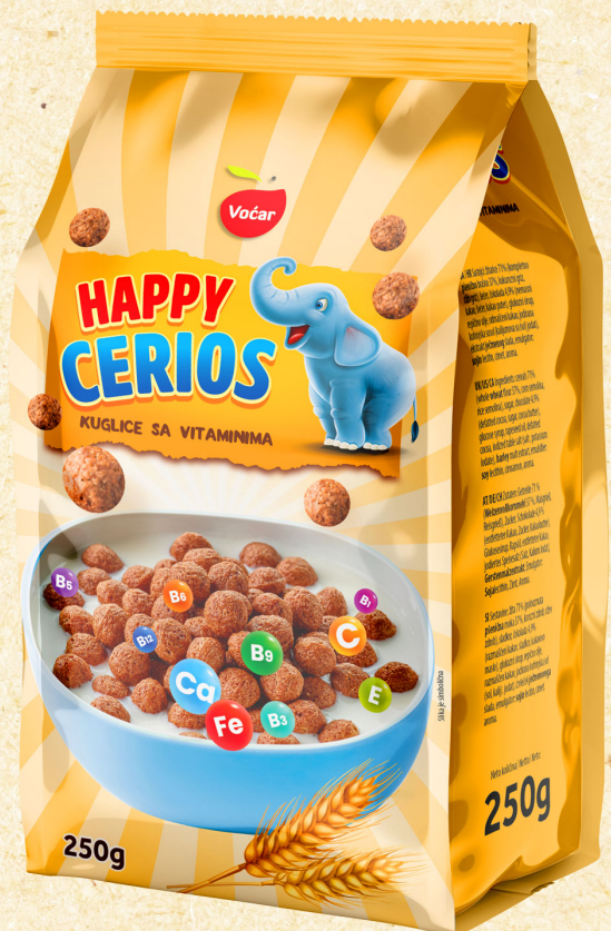
Happy Cerios 250g