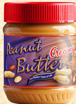
Crunchy Peanut Butter 227g