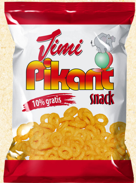
Timi Flips Piquant 90g