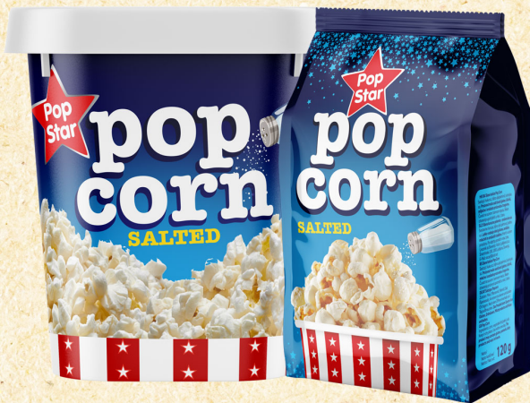
Pop Star Pop corn Salted 120g, 250g