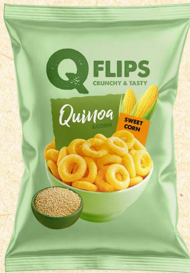
Q Flips Sweet corn 80g