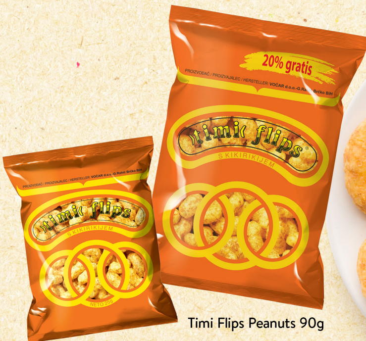
Timi Flips Peanuts 90g