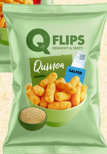
Q Flips Salted 60g