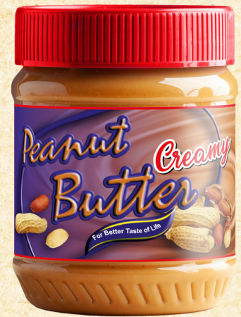
Crunchy Peanut Butter 350g