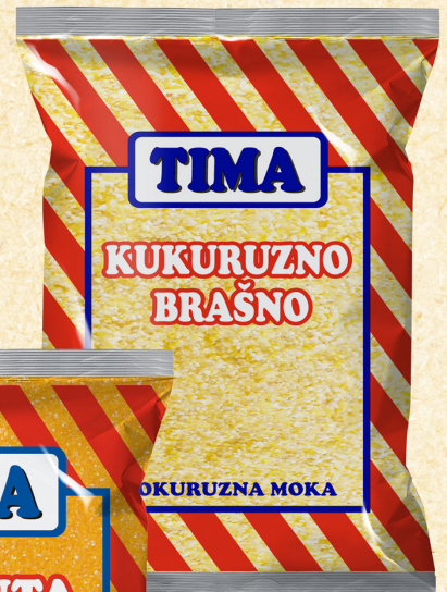
Corn Flour 200g