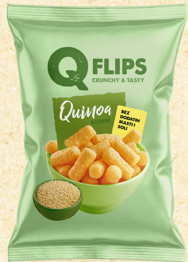
Q Flips Peanuts no fat or salt 60g