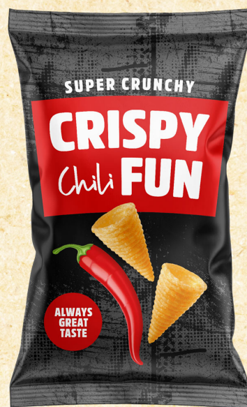
Crispy Fun Chili 50g, 100g