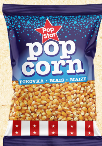
Pop Star Pop corn 500g