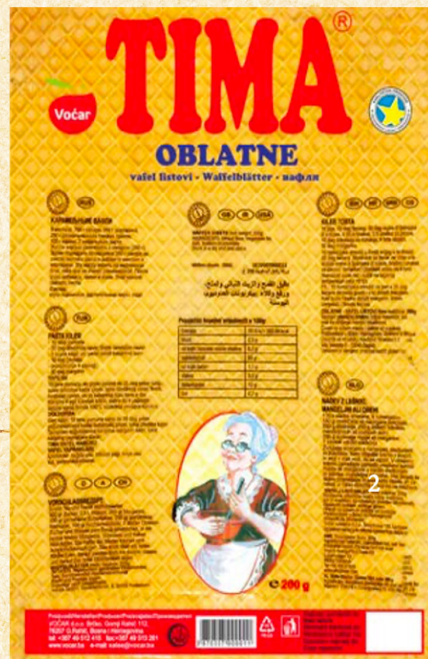
Tima Wafers 200g