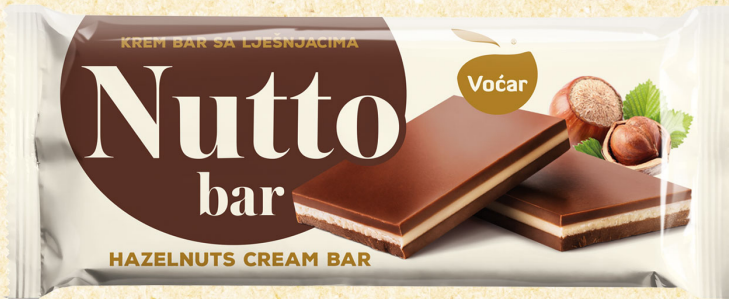
Nutto Cream bar 80g