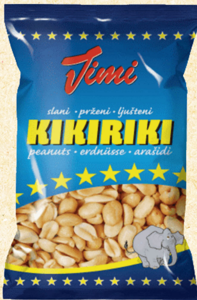
Timi Peanuts vacuum pack 200g