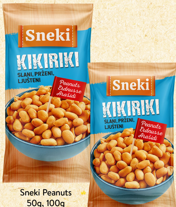
Sneki Peanuts 50g, 100g