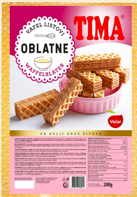
Tima Wafers 200g