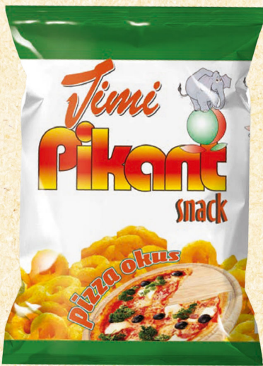
Timi Flips Pizza 30g